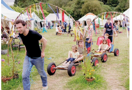
Resurgence Summer Camp 2019

A crucial part of the organisation's work is its varied educational programme of activities and events. The Resurgence Trust has adapted to the challenges brought by Covid-19 and is now holding regular events online.